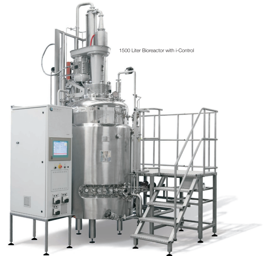
1500 Liter Bioreactor with i-Control

Bioreactors play a key role in the life science industry as an essential tool for, for example, the large-scale production of life-saving vaccines and first-rate medicines. The processing steps leading to these products can be complex, requiring tailor-made systems. This is where Applikon Biotechnology steps in. We provide the industry with solutions – both for development of new products and for the expansion of production capacity. These projects can range from very special mini bioreactors to a complete line of cGMP production systems ranging up to several thousand liters volume systems.